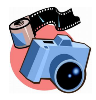
Session Group Photo

Abstract: We propose a statistical machine learning method for estimating the distributions of parameters in a neural system with multiple neurons. Extracting neural systems from observable imaging data is an important subject in machine learning, medical engineering and computational neuroscience. In this study, we formulate the generalized state-space model based on the generative process of the observable data provided by calcium imaging. In the proposed method, we employ particle Gibbs algorithm in order to realize simultaneous estimation of the distributions of the latent variables representing the state of neurons and those of parameters of neuron units and network connectivity. We show that our proposed method successfully estimates not only parameters of individual neurons and but also those of network structure, simultaneously.